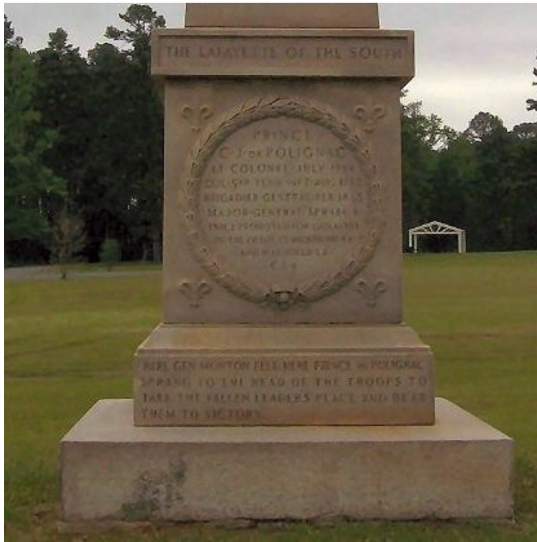
Base of the Polignac Monument, Pleasant Grove battlefield, La, where he is entitled "The Lafayette of the South"

Important information: the Find-a-grave site contains a critical mistake. The exact plot is not given. It's a large aboveground crypt building with a marble stone on the wall inside (see the pictures).