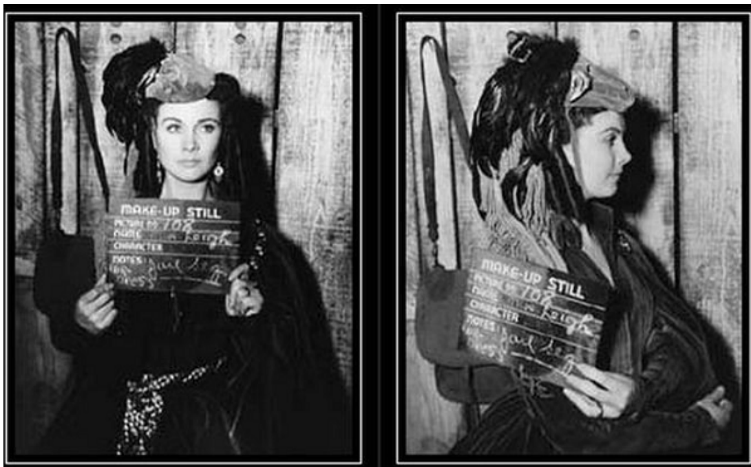
Not a mugshot of Vivien Leigh for police records, but a dress and make up still, taken before starting the first scene (sudden visit to Rhett Butler).

The Curtain Dress, best symbol of Scarlett's will to survive during Reconstruction, was worn in three scenes of the movie: the jail scene in which Scarlett asks Rhett Butler for financial assistance (in the movie the dress is in fact made for that purpose), the scene in which Scarlett walks with Mammy through the streets of Atlanta, filled with crowds of reconstructed rabble, Scalawags and Carpetbaggers, and finally the scene with Scarlett meeting Frank Kennedy (and who is immediately targeted by her as next husband).