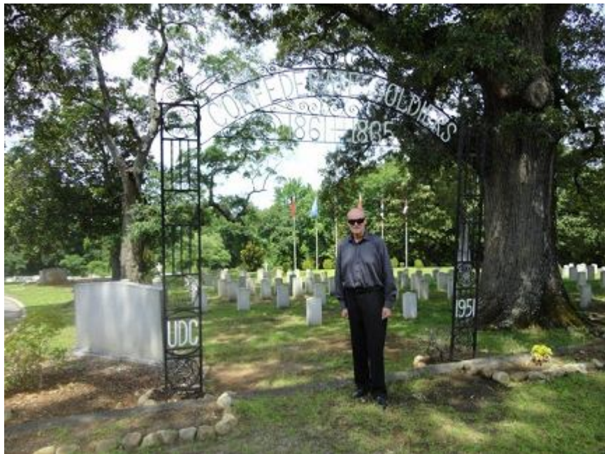
Elmwood Cemetery portal.