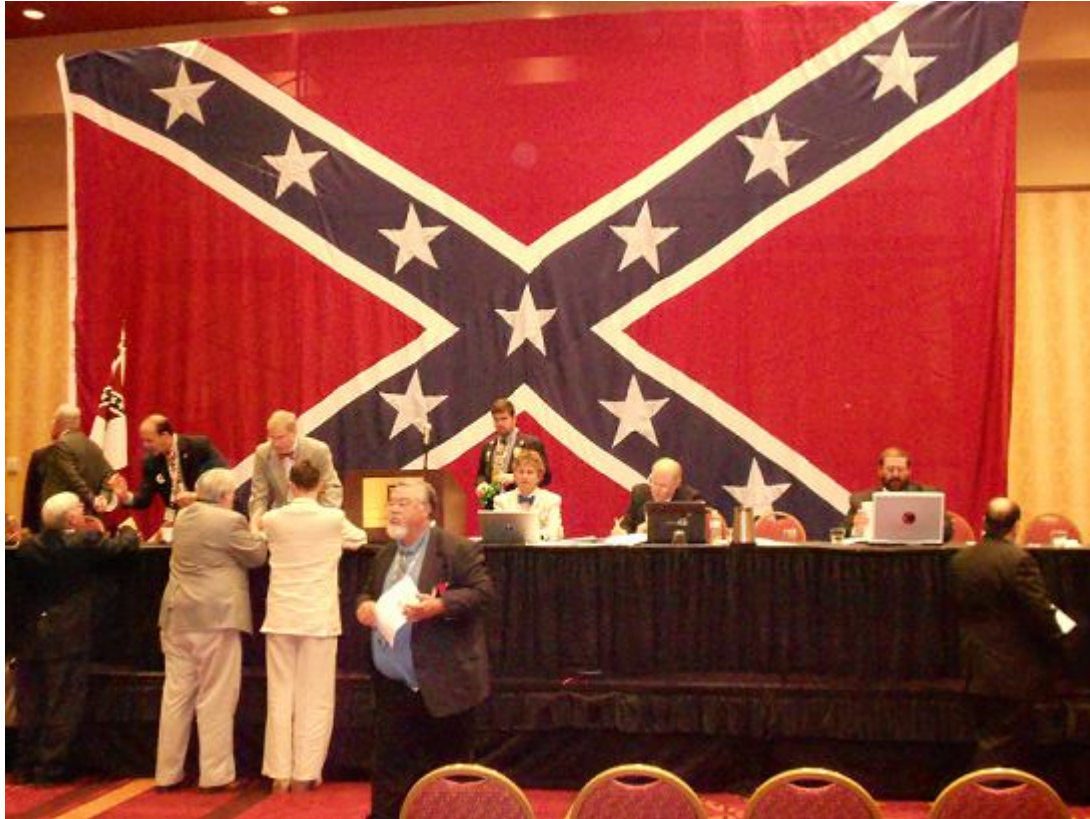
National Convention Stage

And I reminded our stateside compatriots that the next time they salute the Confederate flag at their local meeting, they should remember that they are part of a world-wide network, bound across time and distance with those men in gray. I left the podium again to a standing ovation. Gentlemen, they know about us – and they appreciate all that we do.