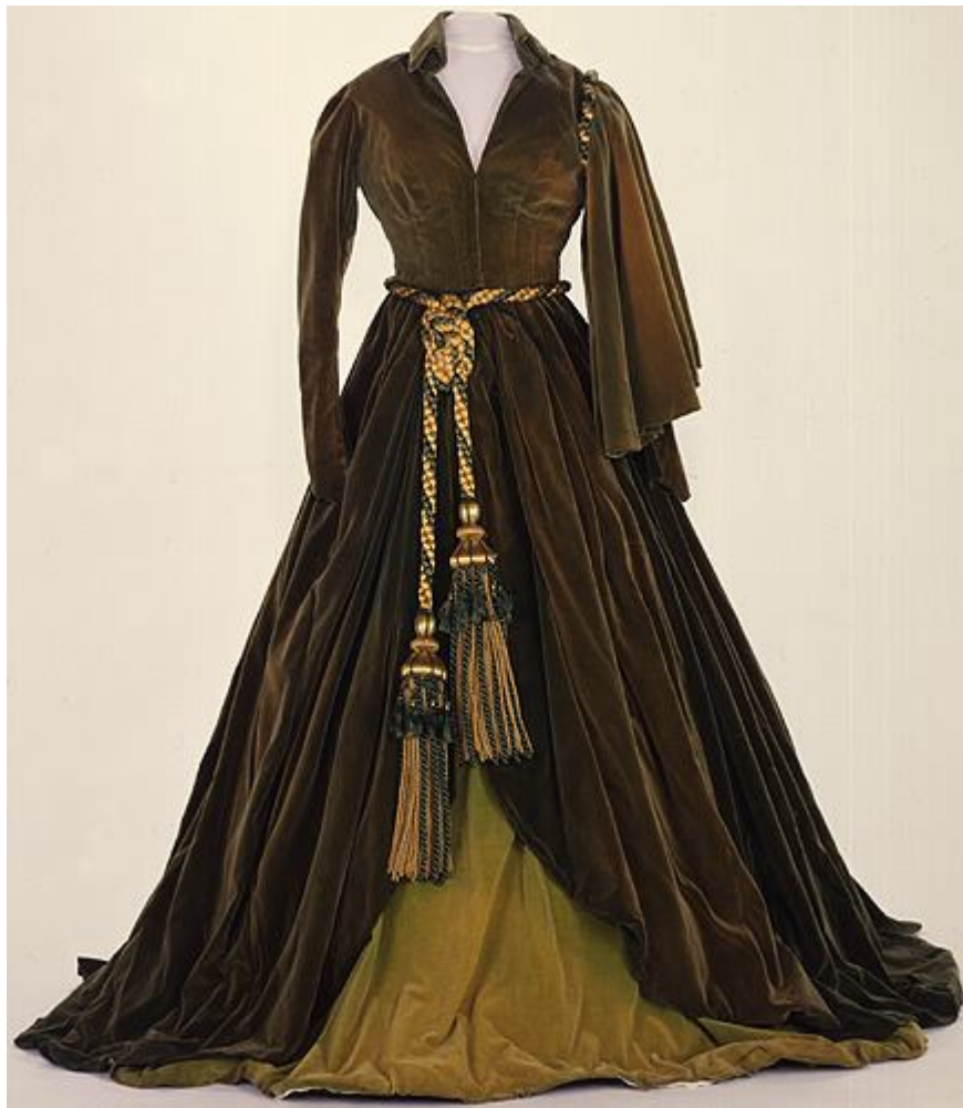
Original robe used in “Gone with the Wind”

"Gone with the Wind" is an absolute classic, a movie which needs no introduction to the reader, for that reason we will point out from time to time single scenes and contents of this legendary motion picture rather than to review the whole movie. Today we will tell you the story of one of the most famous robes of film history: the magnificent dress of Scarlett O'Hara made by taking some green portieres in her home, Tara. A masterpiece of improvisation, it shows pretty well how important it was to maintain a serious ladylike appearance to underline an already existing superior-class female dignity (although Scarlett's sometimes even ruthless survival methods are not entirely representative for Southern women).