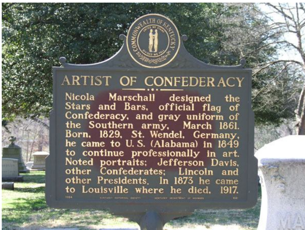
Historical marker, Louisville, Ky.

We are hopeful that some of our Camp members and American compatriots will be able to attend this first of its kind exhibition in St. Wendel. Opening hours: Mo, Wed, Thur, Fri 8:30a.m. – 4 p.m.; Tues 8:30 a.m. – 6p.m.