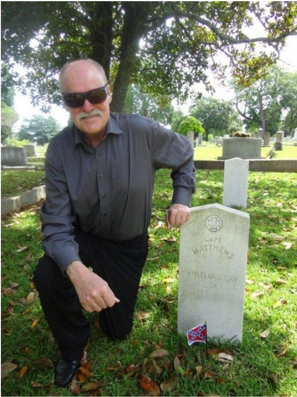
Kneeling at a gravestone